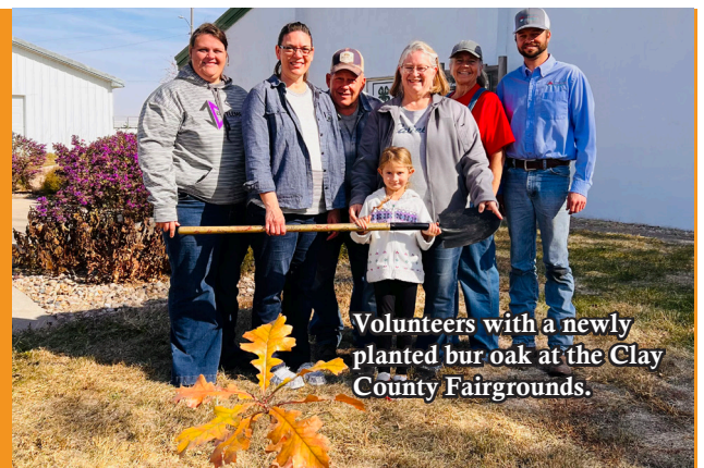
Volunteers with a newly planted bur oak at the Clay County Fairgrounds.