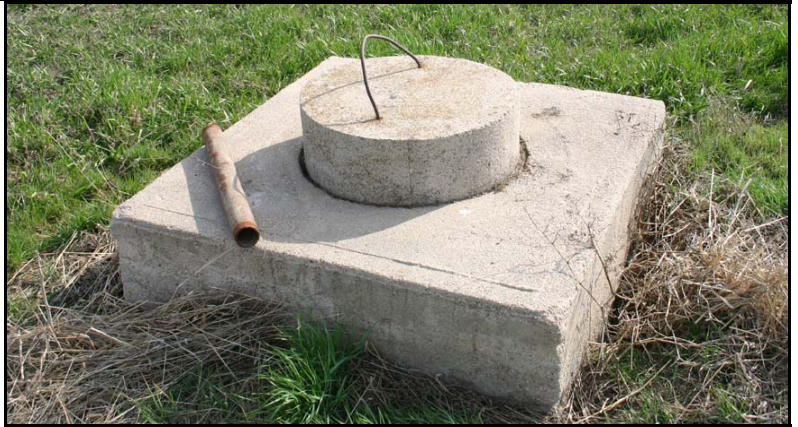
A properly sealed well with cap (York County).

Under the Aquifer Quality Well Abandonment Cost-share Assistance Program in fiscal year 2008, 91 wells were properly abandoned at a cost to the District of $36,647.68.