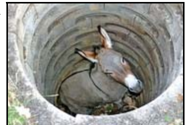
A wayward donkey fell into an abandoned well that was not properly sealed.

In 1989, the District began a program to determine the status of wells that have been reported as abandoned or not registered with the District. A public education program was launched to inform people of the hazards of incorrectly abandoned wells and the importance of notification. In addition, a field survey was made to identify improperly abandoned wells and to take action to correct the situation.