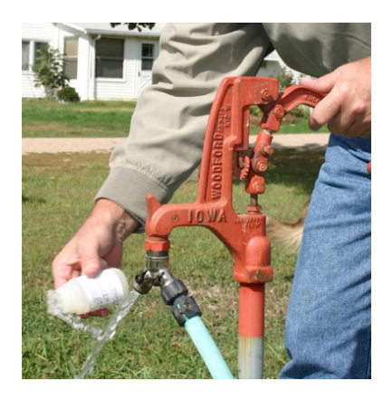
The NRD offers free analysis for nitrates and bacteria in groundwater. Rural domestic wells are not held to public water system regulations, so it is the well owner's responsibility to ensure safe drinking water.