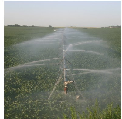
The Upper Big Blue NRD is the most heavily irrigated district in the state, with more than 1.2 million irrigated acres. Managing our water resources well is essential to the continued success of producers in our district.

The owner name and address, and the number of irrigated acres, is based on information we receive from assessors. If you have a change to your number of irrigated acres, you must provide the NRD or the county assessor with a map from the Farm Service Agency (FSA). Your changes will remain "pending" until the county assessor confirms the change. Please note, the FSA does NOT provide the map to the NRD or the assessor's office. You are responsible for providing that information.