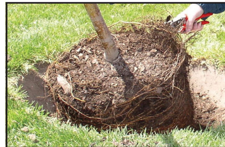
Circling roots cannot supply sufficient water and nutrients to the tree.

Circling roots caused by a container: When roots are left in a container too long, they often grow in a circle. They fail to expand outward even when removed from the container, resulting in an underdeveloped root system that cannot supply enough water and nutrients to the tree. In some instances, a circling root can grow around the base of the tree, girdling it and interfering with absorption. Initially the tree appears healthy, but after several years it may decline in vigor and die.