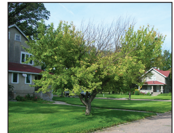
Chlorosis, dieback and general decline may be prevented with proper tree planting and care.

A planting site that is too small can crowd roots so they cannot grow outward. A planting site should be at least 2-3 times wider than the diameter of the root ball since the majority of a tree's roots grow laterally away from the tree.